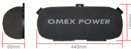
Air filter and back plate (adds 50mm to kit length)

Air filtration – the throttle bodies will accept DCOE / DHLA pattern backplate air filters. 'Sock' filters can be used where space is tight but they can affect airflow so should be avoided if possible.