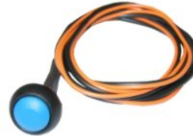
Launch control (button)