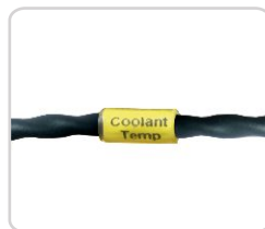
Twisted cables in heatshrink sleeving