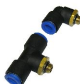
Brake servo adaptor (pre fitted)