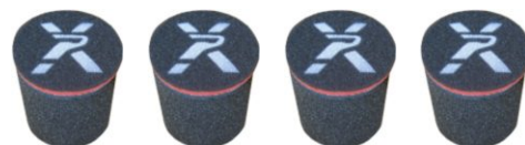
Air filter socks

Synchrometer - This tool measures the airflow through each airhorn to enable fine balancing of the throttle bodies. Fine balancing is recommended for all engines, and is essential for those that need to pass emissions tests. If you are having the engine set-up by a tuner then they will already have this tool.