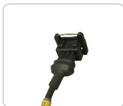
Heatshrink connector boots

The perfect harness should also fit perfectly. The bespoke 'Race' specification is built using the same materials and methods as the standard 'Race' specification harness, but with lengths tailored to suit your engine bay.