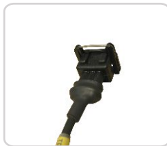
Heatshrink connector boots

The 'race' specification uses lightweight automotive grade cable, loomed together using motorsport heatshrink as found on nearly every professional motorsport harness for high flexibility, resistance to solvents and superior cut resistance. Within this outer, the cables are twisted together to provide resistance against radiated electrical noise from sources such as the high tension sparks, alternator and starter motor giving clean sensor signals to the ECU. The terminals connecting to the ECU are gold plated to ensure the best connections to the ECU possible to maintain the clean signals from the sensors. All joints in the harness are made with crimps rather than solder to withstand the high vibrations often found with solidly mounted drivetrains in race vehicles. The joints and the component connectors are then covered in glue lined heatshrink which is inflexible and so any tension placed on the harness during service goes onto the strong connector housings and cables and so away from the cable joint. All of these improvements together give longer service life and improved reliability in the harsh environment of a motorsport engine bay.