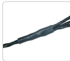
Heatshrink harness joints