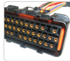
Gold plated terminals