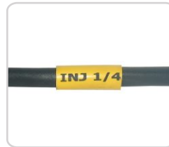
PVC tubing covered cable