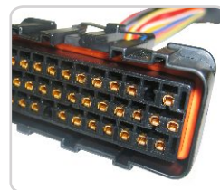
Gold plated terminals