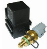
Radiator fan control (Relay & base with coolant temperature sensor)