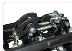
Twin cable throttle linkage kit

Air filtration – the throttle bodies will accept DCOE / DHLA pattern backplate air filters. 'Sock' filters can be used where space is tight but they can affect airflow so should be avoided if possible.