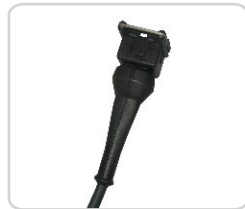
Rubber connector boots

The standard specification harness in this kit is the 'road' specification. This harness uses thin wall, lightweight automotive grade cable loomed together with PVC tubing and harness tape; a specification similar to that found on premium modern road cars. Each harness is individually computer tested to ensure the build is correct.