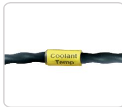
Twisted cables in heatshrink sleeving