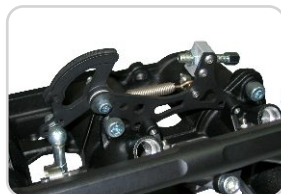
Single cable throttle linkage kit

Throttle linkage – single and twin cable versions are available. They are supplied already built onto the throttle bodies assembly and may be adjusted to give the best throttle action. The linkage can be fitted over or under the throttle bodies pulling to the left or right.