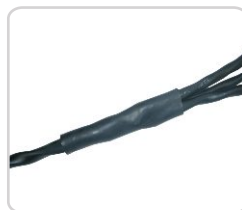
Heatshrink harness joints