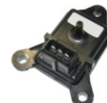
Barometric pressure sensor and harness upgrade