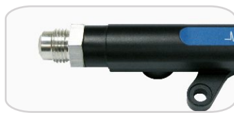
Push-on to screw-on fuel rail and pressure regulator upgrade -6 (pre fitted)

Barometric air pressure correction – If you are using the engine with large altitude changes (such as in the Alps), then air pressure changes due to the altitude changes will affect the amount of fuel required. An upgrade to fit an air pressure sensor to automatically make these changes is available.